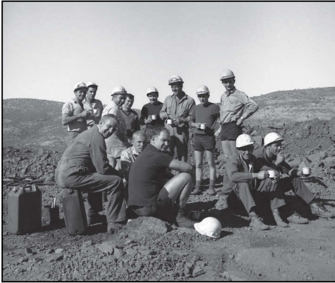
Smoko at Mt Tom Price, 1966